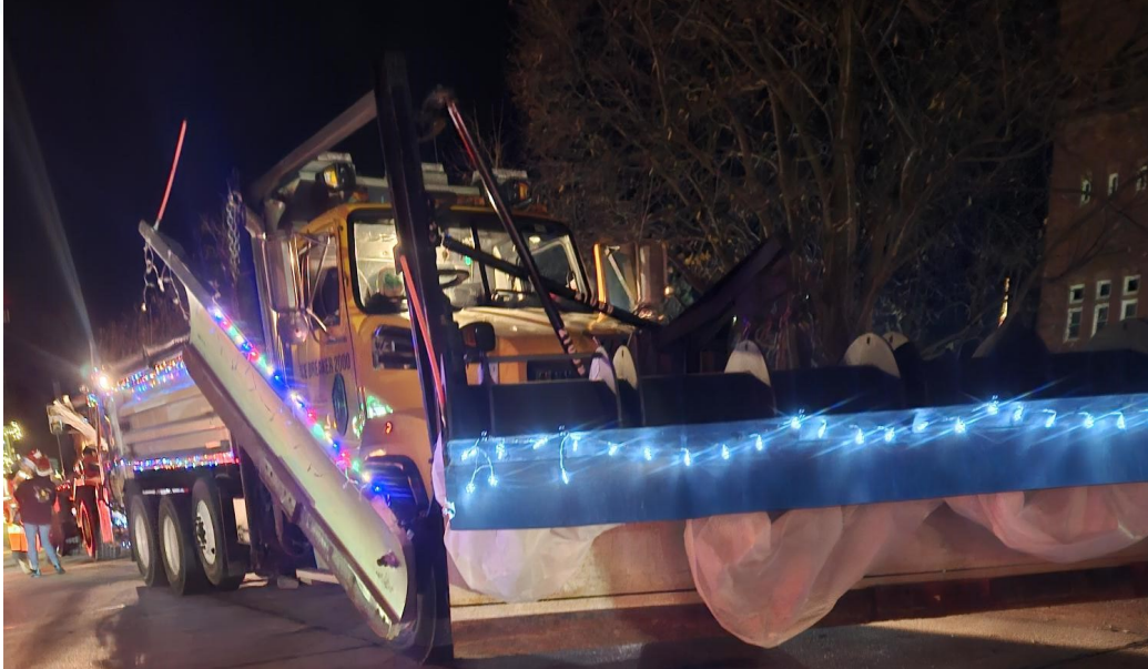
Top: The Ice Breaker driven by Monica Greve