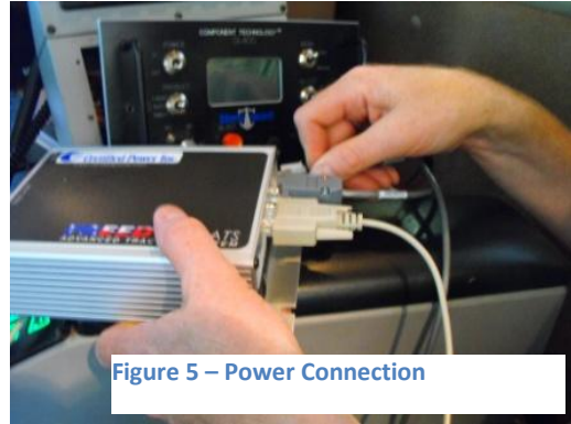
Figure 5 – Power Connection