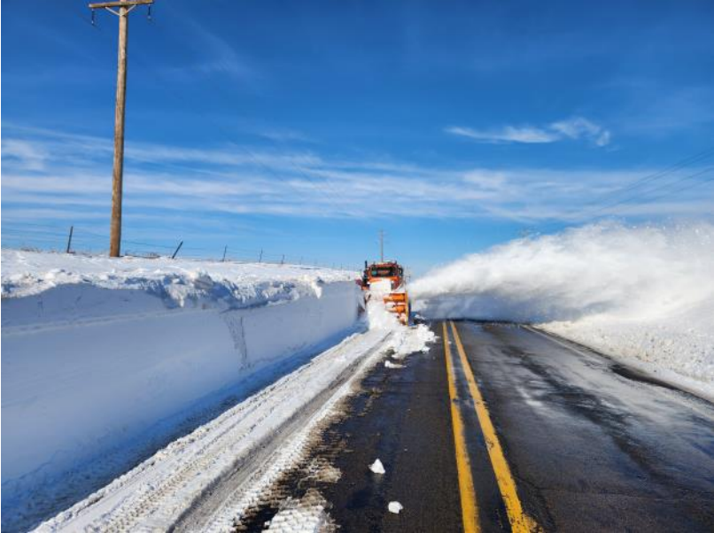
Highway 57 (Left)