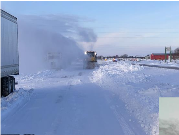
Blower near Winside Highway 35 (Right)