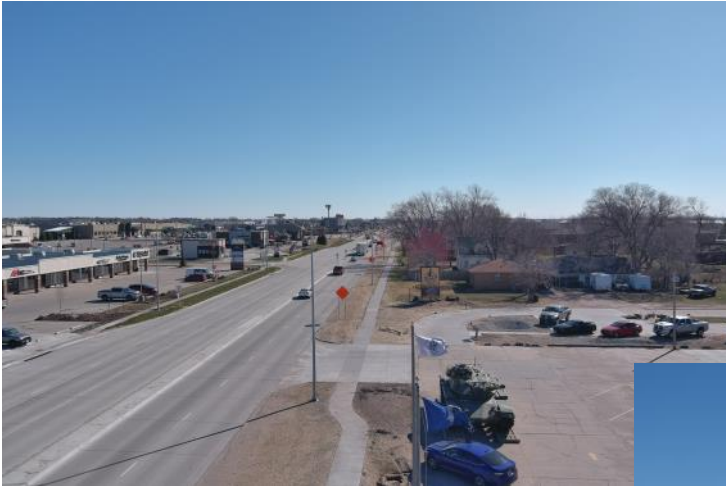
In Columbus Project CN32234, Highway 30