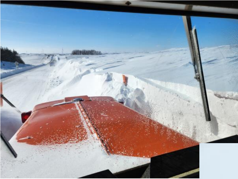
Highway 35 (Left & Below)