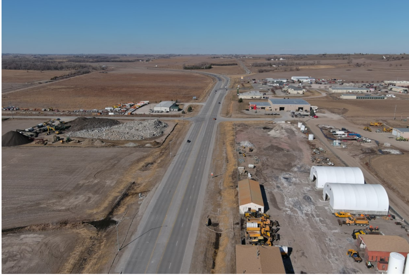
Four Lane West of West Point (Right & Below)