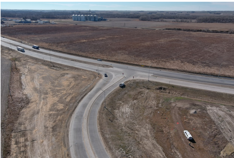
Jct. Highways 275 & 9 (Left)