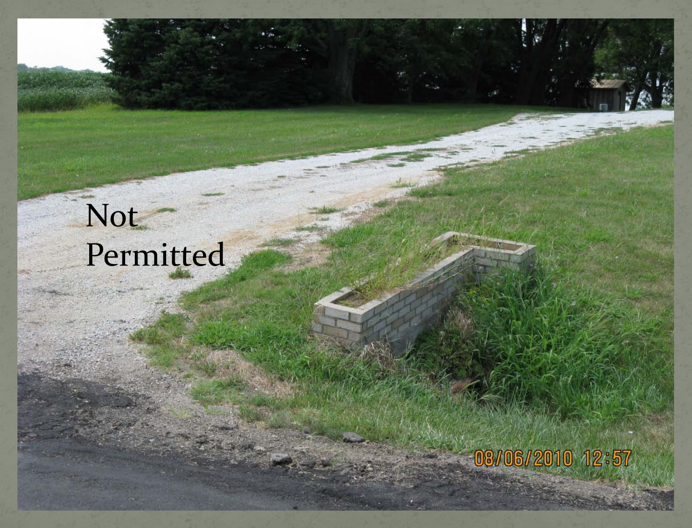
60 Mph Clear zone is 30 Ft from edge of pavement