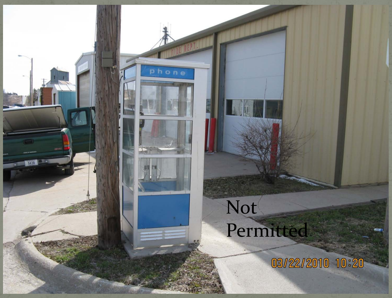
Phone booth is on State ROW and not Permitted on Municipal State Hwy