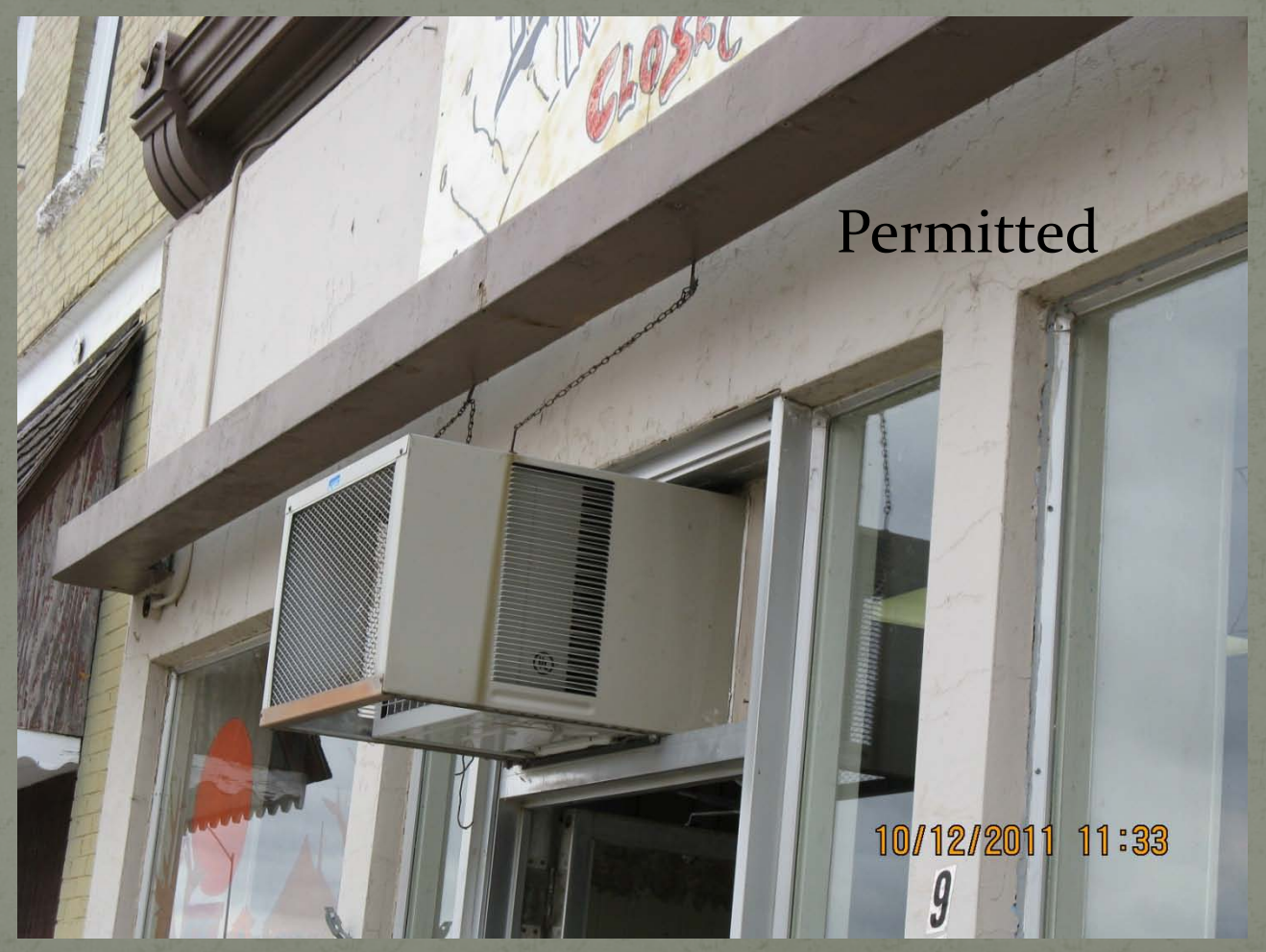
State ROW is the building face, Clear zone is 2 Ft from curbed driving lane