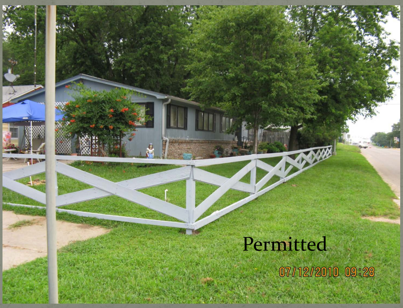
Fence on State ROW, Clear zone is 2 Ft from back of curb driving lane in municipal state Hwy