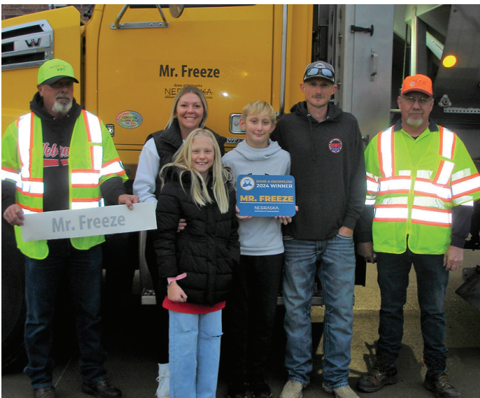
District 4 - Doniphan-Trumbull Public Schools