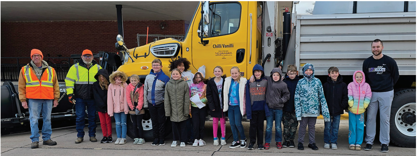
District 7 - Axtell Community School