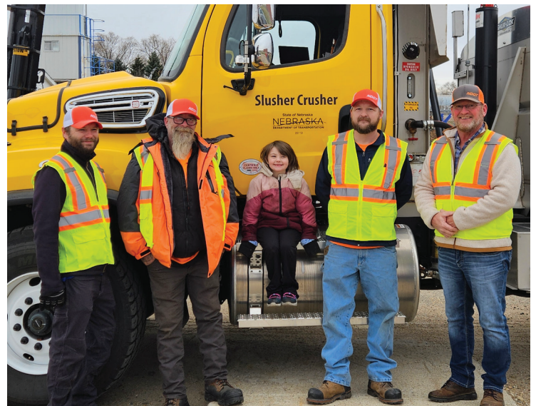
District 8 - Keya Paha County Schools